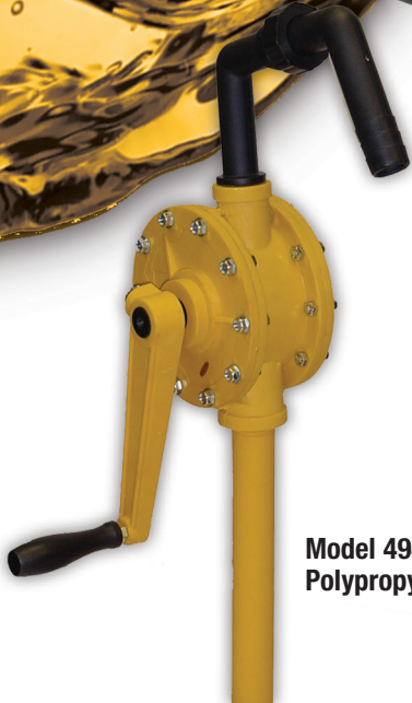
Model 4946-99 Polypropylene

AMT Rotary Drum pumps are offered in a variety of construction materials for dispensing most types of liquids and chemicals. All units include discharge spout, bung adapter and suction tube assembly. Each model is in stock available for 24 hour shipment. AMT Rotary Drum pumps are designed for pumping liquids compatible with pump component materials. Liquids must be free of debris and any solids for proper operation.