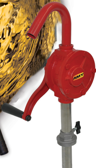
Model 4822-95 Cast Iron